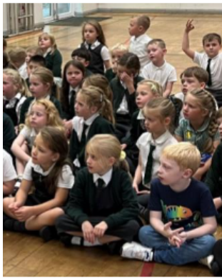
Singing together! 🎵 🎵 🎵