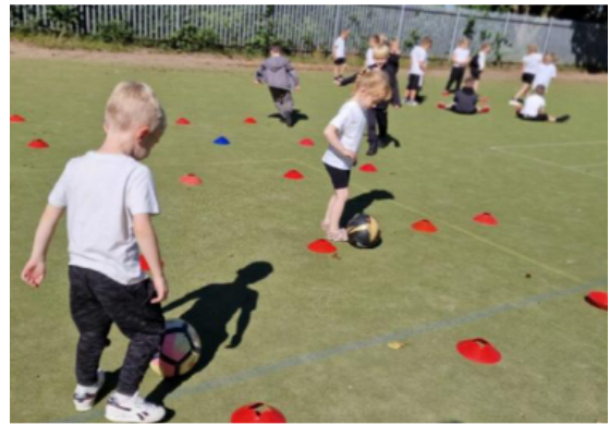
PE in the sun! ☀️ ☀️ ☀️

In PE we have been focusing on ball skills, agility and shooting a ball into a goal.