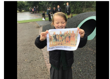
Wow - so long ago!