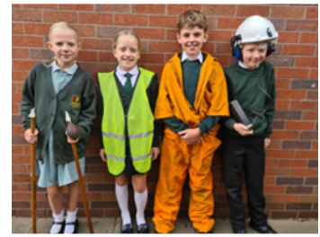
Dressed for the job!