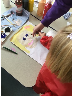
Talking about my features

For our learning tasks we have begun to learn to write our names and have been painting our self portraits, here our some of us in action..