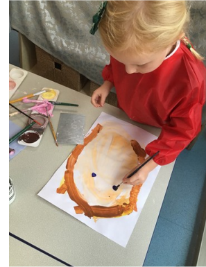
Thinking and looking!