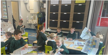
Rufford hard at work!

In science we have had lots of fun thinking about what we notice in Autumn, looking forward to our Autumn walk in the coming weeks – more details to come soon about that!