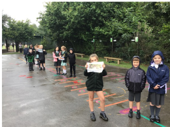
A long time ago!