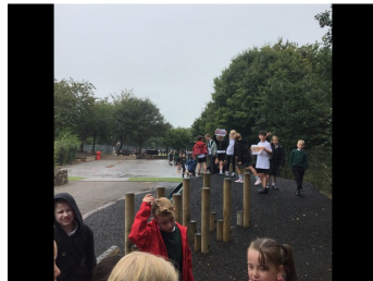
A very long time ago!