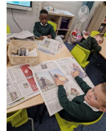
Collaborative working in Sherwood