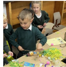
What does this feel like?