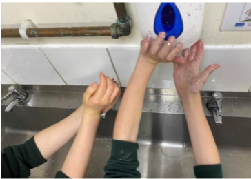
Washing the glitter germs off!

In RSHE we have been talking about personal hygiene, particularly the importance of washing our hands – we explored this in a fun way by washing off the “glitter germs”.