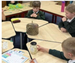
Exploring our senses