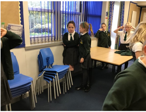
What no chairs?