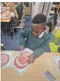
Learning healthy habits

In DT, we have looked at what a healthy and unhealthy meal is – we made some Victorian gruel and decided why it was an unhealthy meal.