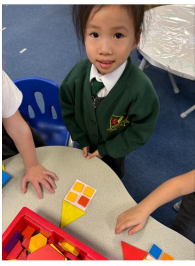
Caught being amazing!