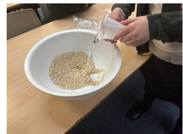
Imagining the life of a child in Victorian times